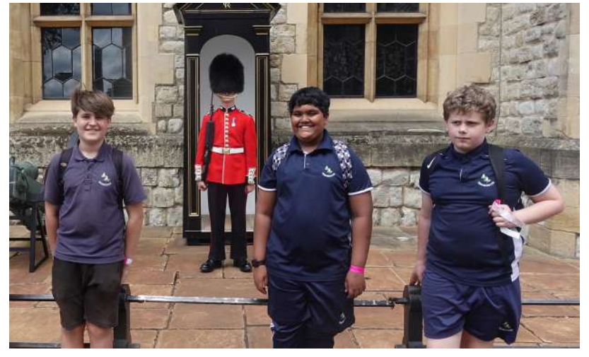
OUR Year 7 students pictured outside the historic Tower of London on a geography and history trip.