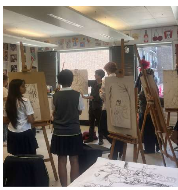
OUR students have been inspired to create their own art work following lectures from the Royal Drawing School.