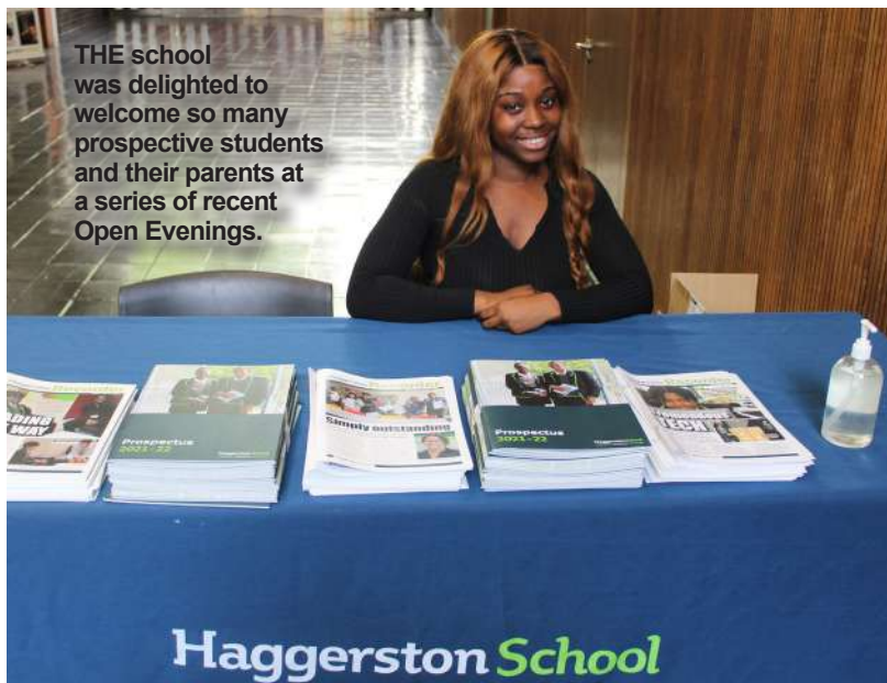
THE school was delighted to welcome so many prospective students and their parents at a series of recent Open Evenings.