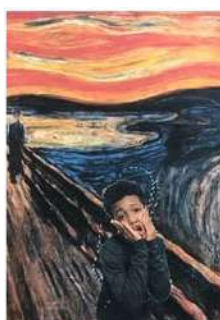
Clay. The Scream. By Edvard Munch, 1893.