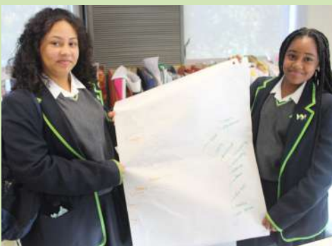
Students learned a lot on Character Day.

In addition, to celebrate Black History Month we put up a display of Black heroes, played music from black artists, put together an array of books, as well as enjoying Caribbean food in the canteen.