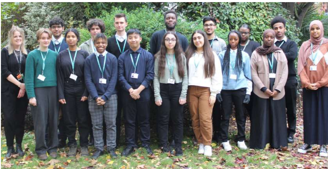
SIXTH Form students will learn leadership skills as they mentor younger pupils with their reading and writing after coming through a rigorous selection process.

The students were picked as Future Leaders after demonstrating the key skills needed to take up the role in their applications.