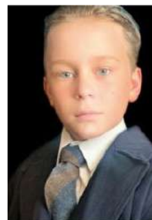
Sidney. King George V. By Sir Oswald Birley, circa 1933.