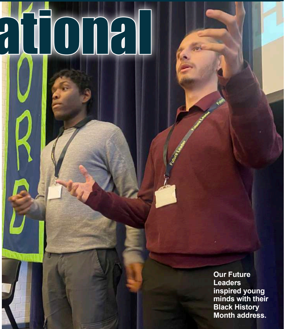
Our Future Leaders inspired young minds with their Black History Month address.