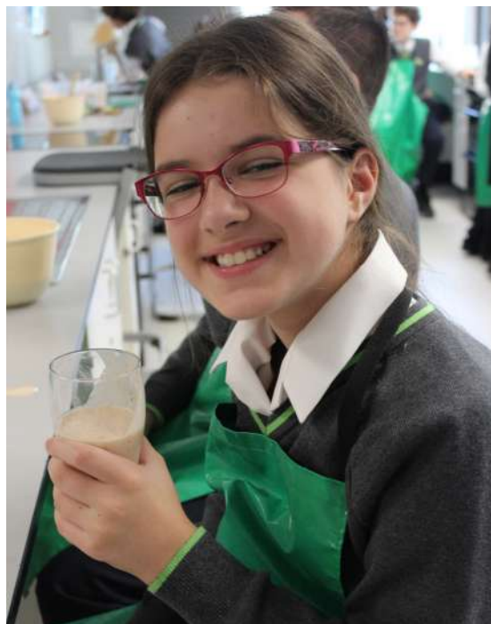
STUDENTS have been enjoying learning how to make delicious smoothies in our kitchens.