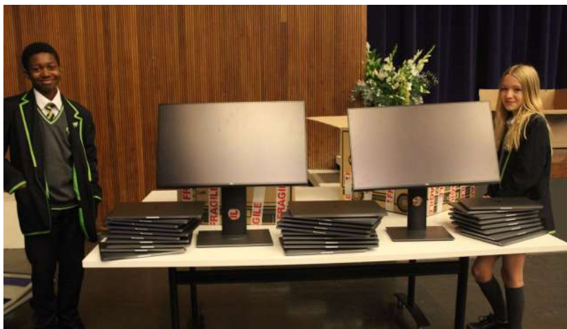
CHARITY, Open Palm, and online banking company, Monzo, donated MacBooks and monitors to our Music and Design & Technology students.