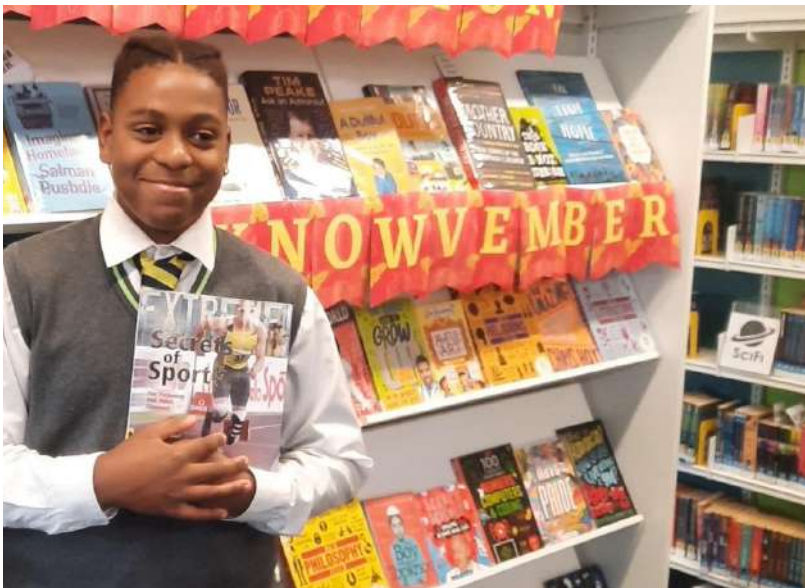
NON-FICTION November prompted students to try different types of books from the library.