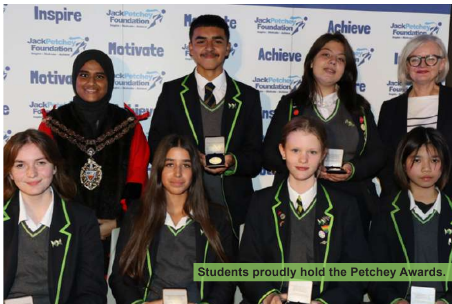
Students proudly hold the Petchey Awards.