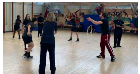
Year 8 drama students learned acting techniques at a workshop with company Frantic Assembly.