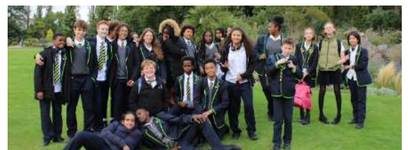
STUDENTS were rewarded for progress in drama with a rewards trip to an at Regent's Park Open Air theatre (above). The Year 9s watched Inua Ellams's interpretation of Antigone.