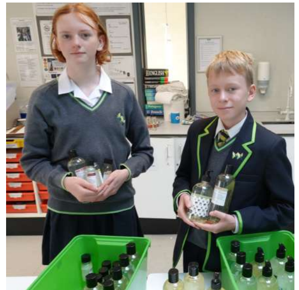
OUR Eco Council students are supporting families in reducing plastic waste by filling up old empty bottles with fresh soaps and products that can be used in their homes.