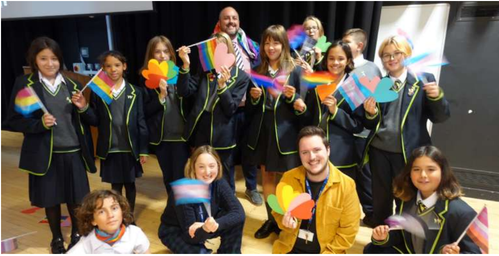
OUR Pride Group has been meeting every week since the beginning of term to discuss equality within our school and to empower all of the students.