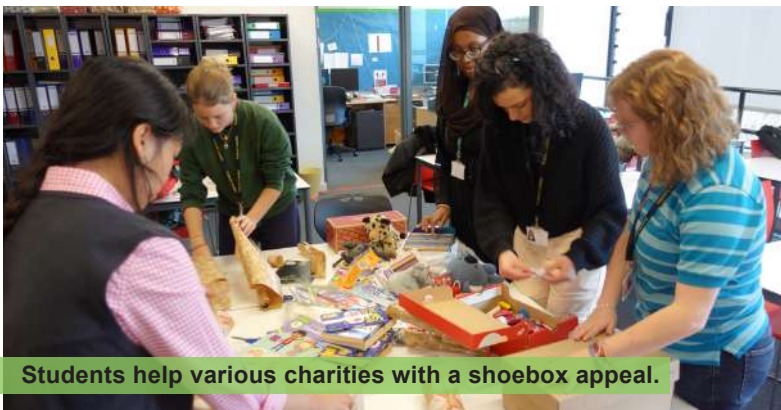
Students help various charities with a shoebox appeal.

OUR sixth form Voluntary Charity Enrichment group have selected a wide range of charities to support this term.