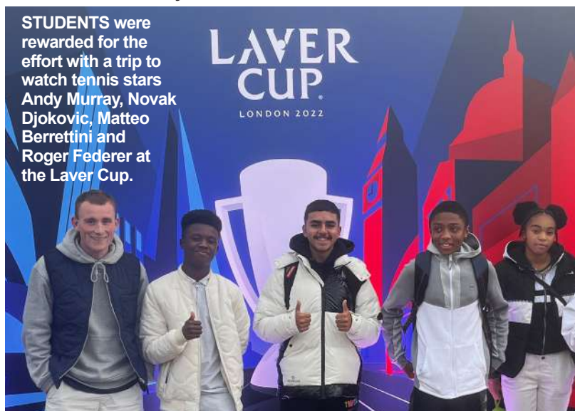
STUDENTS were rewarded for the effort with a trip to watch tennis stars Andy Murray, Novak Djokovic, Matteo Berrettini and Roger Federer at the Laver Cup.