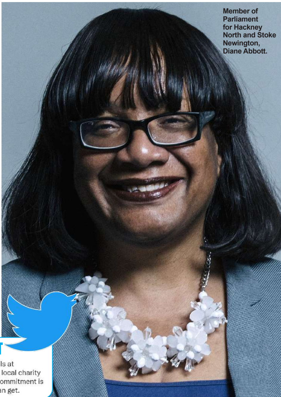
Member of Parliament for Hackney North and Stoke Newington, Diane Abbott.